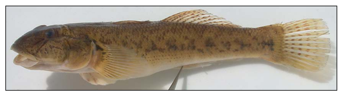
Figure 9. Awaous aeneofuscus from the Nosivolo River near Marolambo, collected with at throw net.

Awaous aeneofuscus Peters 1852 (common name = Atoho) was collected in Nosivolo River and tributary systems in varied habitats. It appears to be widespread although not very common in fishermen's catches. A photograph of A. aeneofuscus from the Durrell Wildlife/Conservation International files (Hpim0089.jpg) gives a new record size for this species of 340 mm TL.