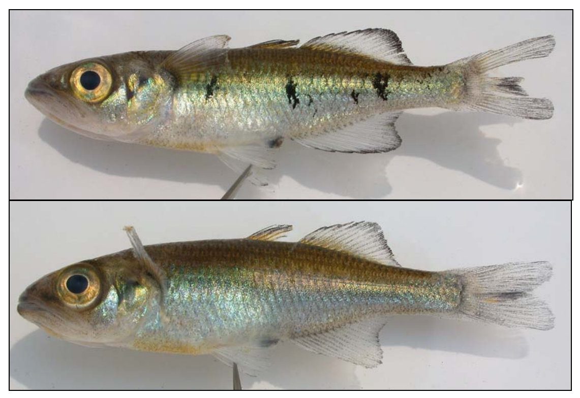
Figure 5. A male (upper) and female (lower) Rheocles wrightae from the upper Sahanao stream near Lavajiro Village, collected with at throw net.

Pers. com. Dr Melanie Stiassny). These were usually collected together with Bedotia sp. 'Nosivolo' although were usually less numerous than Bedotia . Two size classes were usually present – a large adult class (approximately 100-120mm TL), which was rare and juveniles of 20-30mm TL, which were presumably last year's recruits. This species was described from the Sandrangato River, south of Moramanga. If this is a correct identification then these Nosivolo records will probably result in a down-grading of its IUCN status due to a considerable increase in its known geographical range and population size.