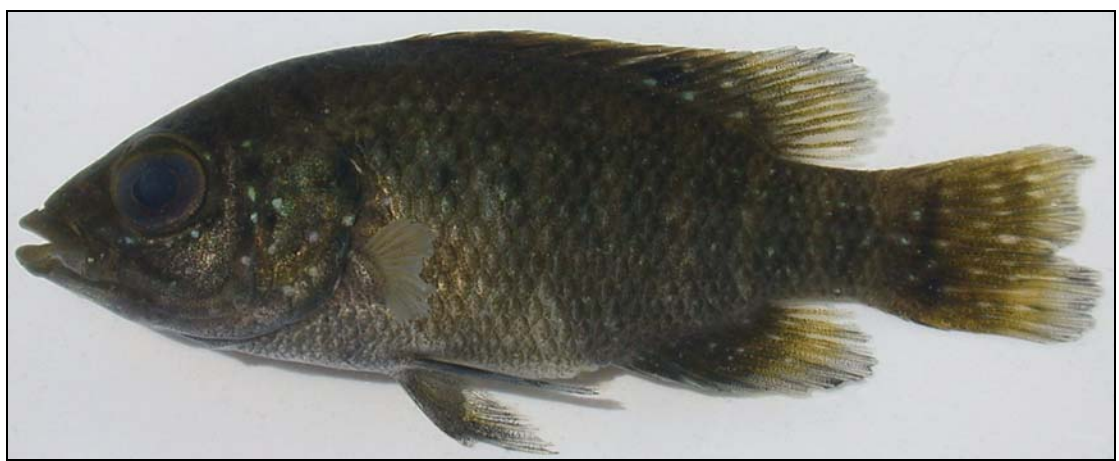
Figure 6. A juvenile Paratilapia bleekeri from an isolated pool (M5) on the Nosivolo River near Marolambo, collected with rotenone.

Eleotris pellegrini Mauge 1984 (common name = Soboeta, Soadiboka, Atohobolitika) was reported in previous reports on the Nosivolo River. Our November collections did not produce any specimens but we did collect another eleotrid Ratsirakia legendrei. At this stage I am unsure if this is simply a case of misidentification or if both species are present within the system. From my own experience of other Eleotris species within southern Africa Eleotris usually occurs lower down in systems so I would not predict its occurrence in the Nosivolo or upper Mangoro catchments.