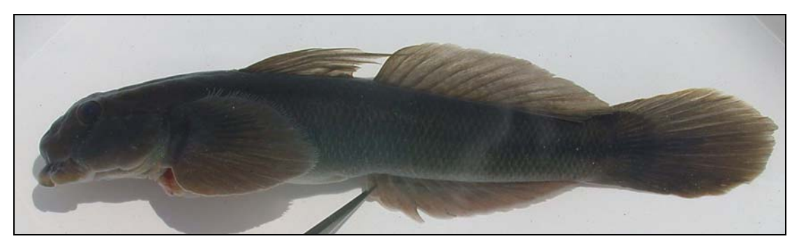
Figure 8. A male Sicyopterus franouxi from the Nosivolo River upstream of Marolambo, collected with at throw net.

Sicyopterus franouxi (Pellegrin 1935) (common name = Filelabato) was found in rapids at all sites within the main Nosivolo River and larger tributary (Sahanao River). It occurs in fast sections of rapids where it adheres to rocks with the pelvic sucker-disc. Large adult males were dark in colour with sometimes a broad lateral band, females were lighter in colour with indistinct vertical barring while juveniles have two horizontal bands on the body (Sparks & Nelson 2004). Fish were caught using a mask and snorkel in combination with a throw net.