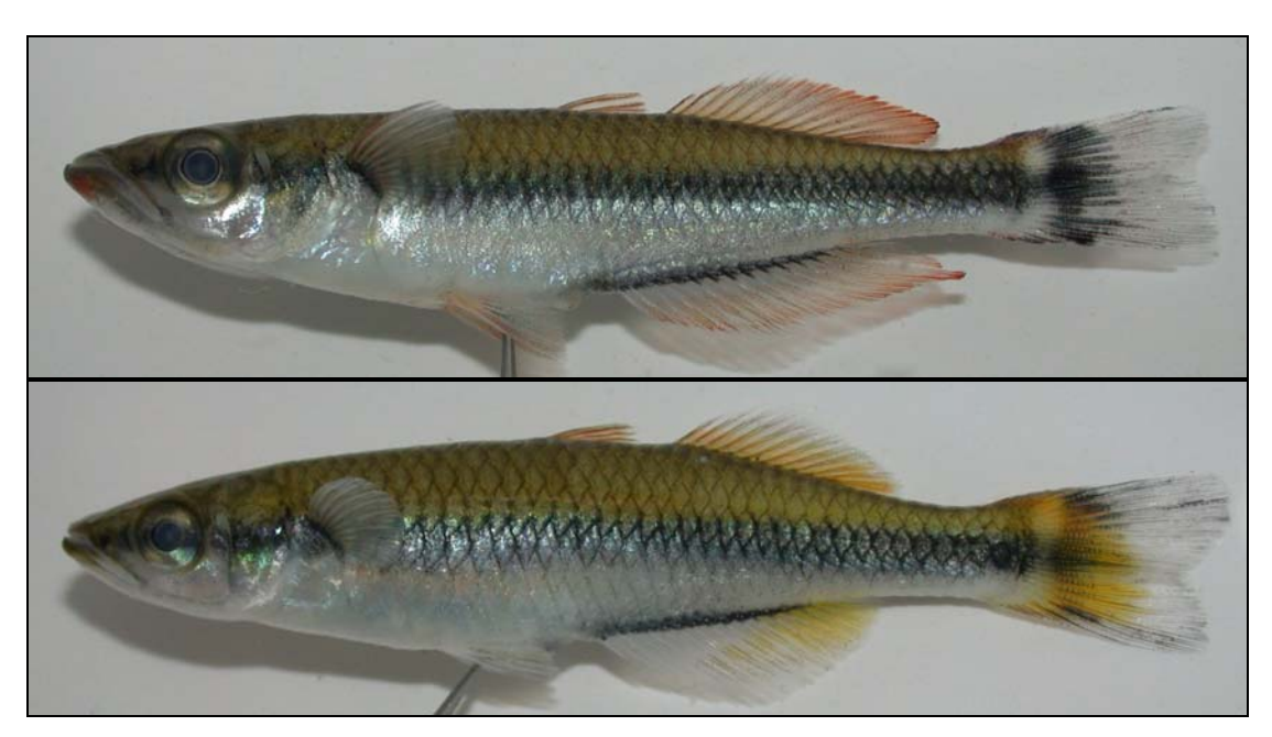
Figure 4. A male (upper) and female (lower) Bedotia sp. 'Nosivolo' from the Sandranamby River just upstream of Betampona village near Marolambo, collected with a hand net, mask and snorkel

Bedotia sp. 'Nosivolo' (common name = Vily, Zono) (IUCN status: VU: B1ab(i,ii,iii)+2ab(i,ii,iii)). An undescribed species widely distributed in waters around Marolambo in both the mainstream Nosivolo through to very small streams. Sexual dichromatism with male fins becoming more red and with a red to the lower jaw, females more yellow colouration in the bases of the fins. Usually found in quiet waters at the edges of rapids and falls, appear to move up streams during the spring possibly to spawn. According to work by Stiassny and Sparks most of the bedotids feed on drift material originating from the terrestrial environment. As such they may be less affected by sedimentation than species reliant on foraging in the substrate such as catfishes, eleotrids and gobies.