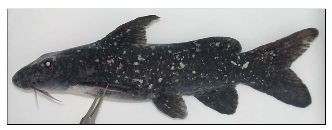
Figure 3. Gogo ornatus collected by gill netting in the Nosivolo River at Marolambo.

Bedotia sp. 'Nosivolo' (common name = Vily, Zono) (IUCN status: VU: B1ab(i,ii,iii)+2ab(i,ii,iii)). An undescribed species widely distributed in waters around Marolambo in both the mainstream Nosivolo through to very small streams. Sexual dichromatism with male fins becoming more red and with a red to the lower jaw, females more yellow colouration in the bases of the fins. Usually found in quiet waters at the edges of rapids and falls, appear to move up streams during the spring possibly to spawn. According to work by Stiassny and Sparks most of the bedotids feed on drift material originating from the terrestrial environment. As such they may be less affected by sedimentation than species reliant on foraging in the substrate such as catfishes, eleotrids and gobies.