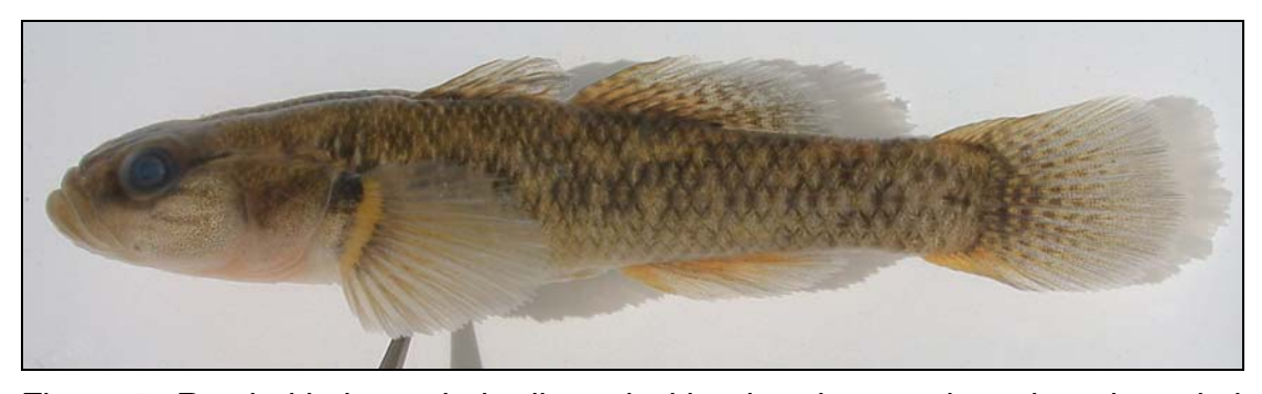
Figure 7. Ratsirakia legendrei collected with a hand net and mask and snorkel in the Nosivolo River at Marolambo.

Ratsirakia legendrei (Pellegrin 1919) (common name = Soboeta, Soadiboka, Atohobolitika) was collected in several Nosivolo and tributary sites. It was observed amongst rocks and sand in faster flowing areas of both large rivers and small streams. The eleotrids rest on and forage in the susbstrate and avoid the fast flows by being in the 'dead-water zone' close to the substrate. This record appears to be a southerly extension of the species' known distribution and so comparisons with material from other populations should be made to accurately determine the specific status of Nosivolo Ratsirakia specimens.