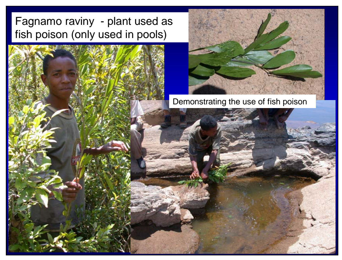
Figure 2. Plant used for poisoning still waters around the Marolambo region.