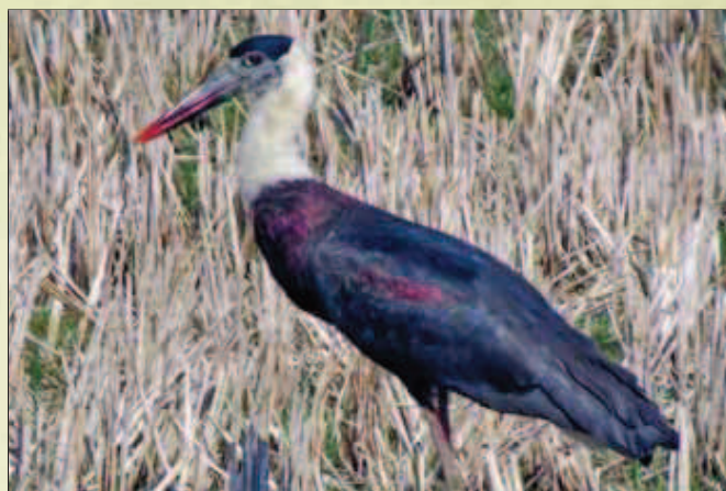
White Necked Stork at Tilaya Dam

( Pandion haliaetus ) and Fulvous/Large Whistling Duck ( Dendrocygna bicolor ) were listed as Schedule I as per The Wildlife (Protection) Act, 1972 (Table - 2).