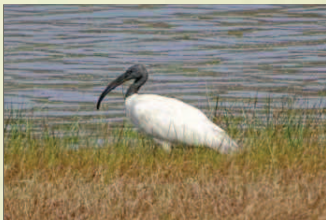
Oriental White Ibis at Malay Dam

Resident birds, Lesser Adjutant (Vu) and Darter (NT) were recorded only at Udhuwa Lake Bird Sanctuary. White-necked Stork (Vu) also a resident species was recorded at Tilaya Dam, Udhuwa Lake Bird Sanctuary, Tenugaht Dam and Malay Dam (Latehar). Oriental White Ibis (NT) was sighted at Tilaya Dam, Udhuwa Lake Bird Sanctuary (maximum number 800), Khandoli Dam (Giridih), Sitarampur Dam (Saraikela) and Malay Dam.