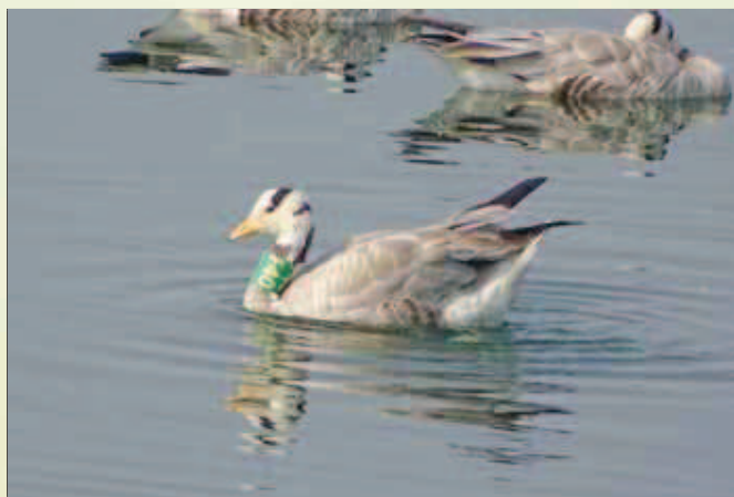
Tagged Bar Headed Goose at Konar Dam

During the survey at Konar Dam (Hazaribag) and Hatia Dam (Ranchi), a green collared tagged Bar-headed Goose was sighted. It is interesting to report that the bird was photographed and the green collar contained the code F 40. Similarly, another green collared tagged Bar-headed Goose was also sighted at Hatia Dam but unfortunately we were unable to take good photograph of it. However the collar bore a code that started with letter K. The details of the collared bird species were sent to Bombay Natural History Society (BNHS) for getting information of tagged Bar headed Goose observed in Jharkhand. Subsequently the BNHS and Head, Laboratory of Ornithology, Institute of Biology, MAS, Wildlife Science and conservation Center, Mongolia confirmed that the tagging was done in Mongolia. Further the Bar-headed Goose with the code F40, sighted at Konar Dam was tagged on 15 July 2013 at the Northwest bay of the Terkhiin Tsagaan Lake in province Arkhangai of the Central Mongolia (capture location N 48.161426, E 99.596579 ) and the other bird from Hatia Dam with code-K was also tagged in Mongolia. These information ascertain that the migratory Bar-headed Goose come from Mongolia in Jharkhand.