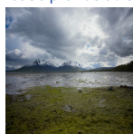
Balsfjord

Please provide at least one photograph of the site: