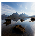
Balsfjord