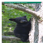
Brochure ( USFWS, 01-08-2017 )