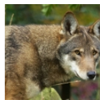
Red Wolf